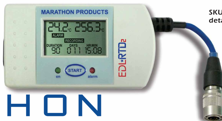
SKU #7012 with detachable probe.