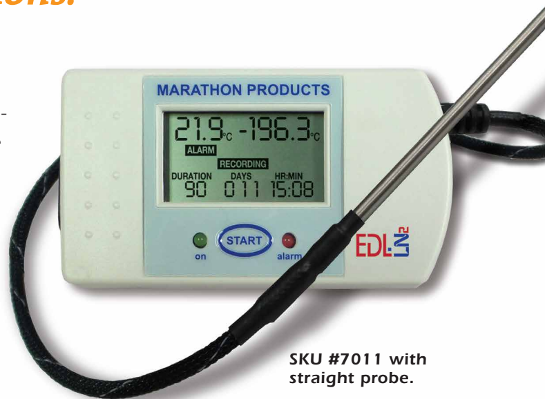
SKU #7011 with straight probe.

In conjunction with our MaxiThermal software, you can document your monitoring for your GxP and FDA regulated environment. To download recorded information, simply plug the unit into a PC using a standard USB connector. The USB cable and PC software are available as accessory items.