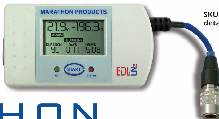
SKU #7034 with detachable probe.